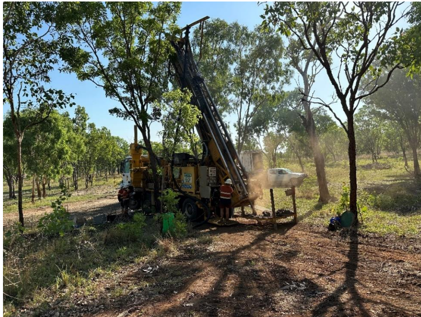
Figure1: Hole LERC_52 being collared on Tuesday 5 November