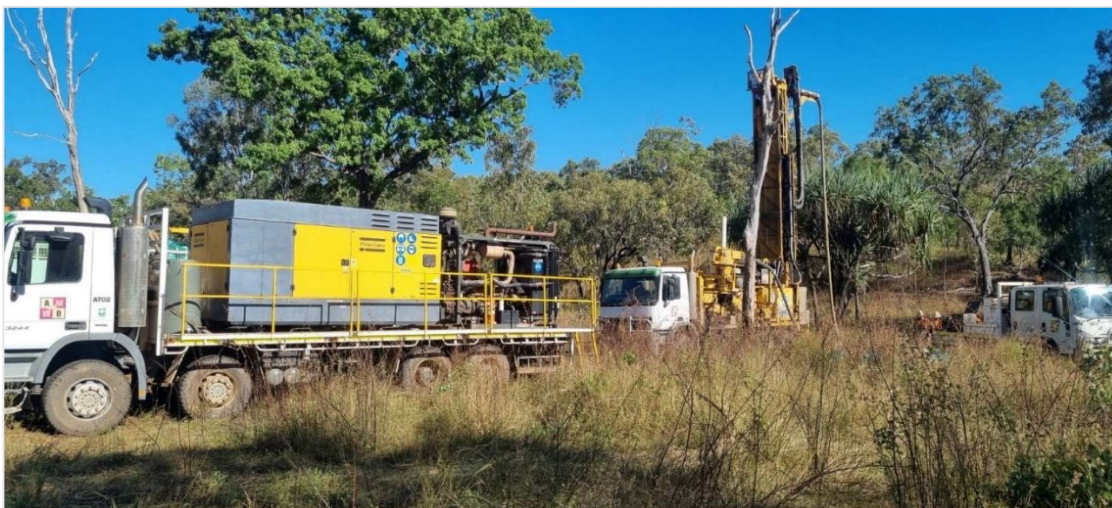
Figure 1: AMWD drill rig setting up at Leliyn Graphite Project